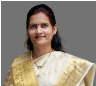
Dr. Bharti Pravin Pawar, Minister of State, Ministry of Health & Family Welfare Government of India