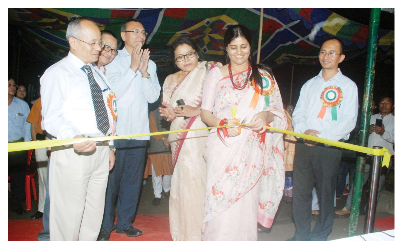
Inauguration of Digital Payment Facility by Honourable Union Minister of State for Health and Family Welfare, Smt. Anupriya Patel