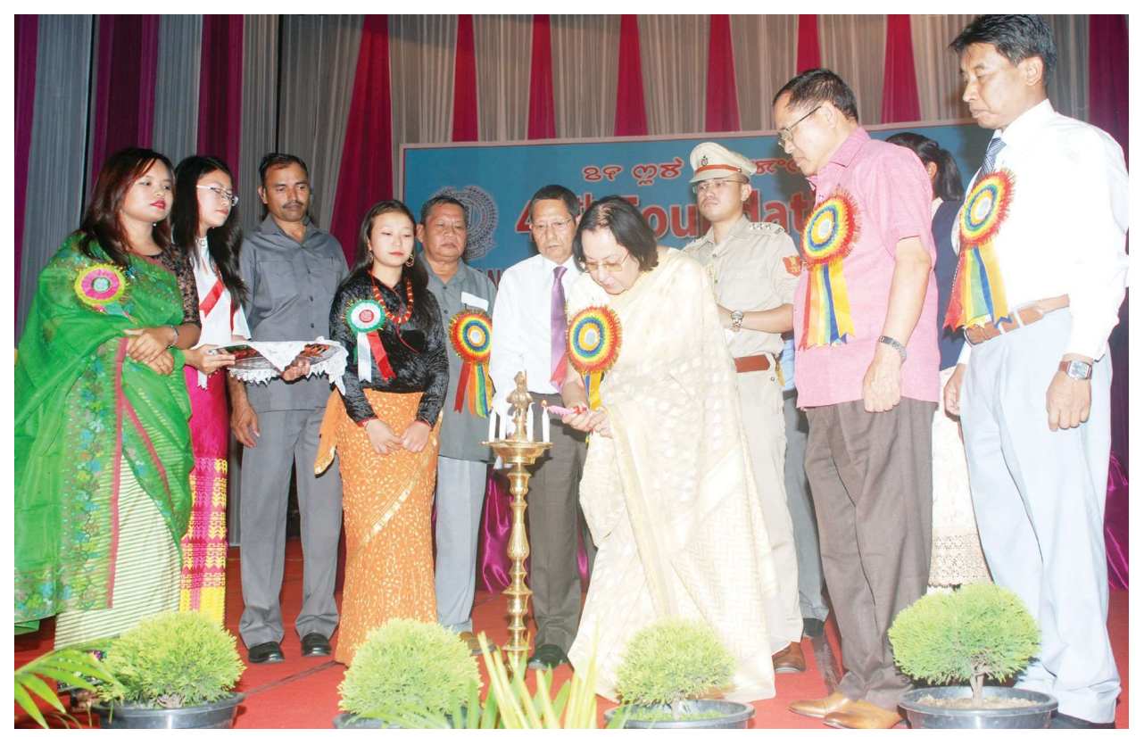
Lamp Lighting of 45th Foundation Day Celebration by Her Excellency Governor of Manipur Smt Najma A. Heptulla