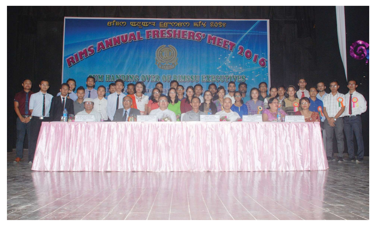
Freshers' meet 2016