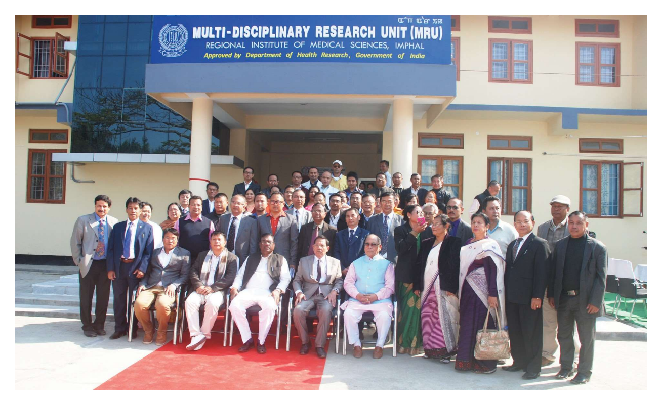
Inauguration of Multi-Disciplinary Research Unit by Honourable Union Minister Of State for Health and Family Welfare , Shri Faggan Singh Kulaste