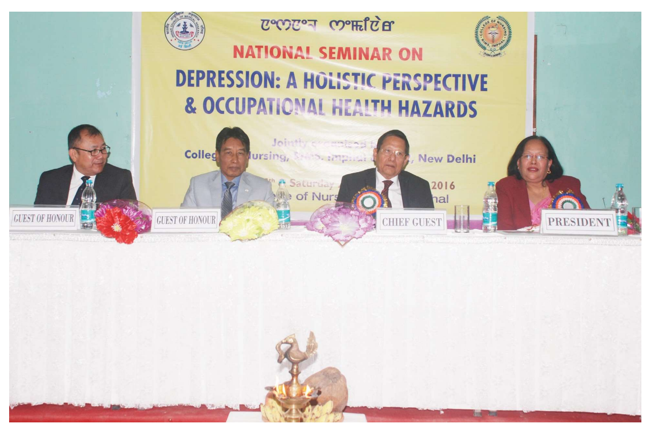
National seminar on Depression- a holistic perspective and occupational health hazards