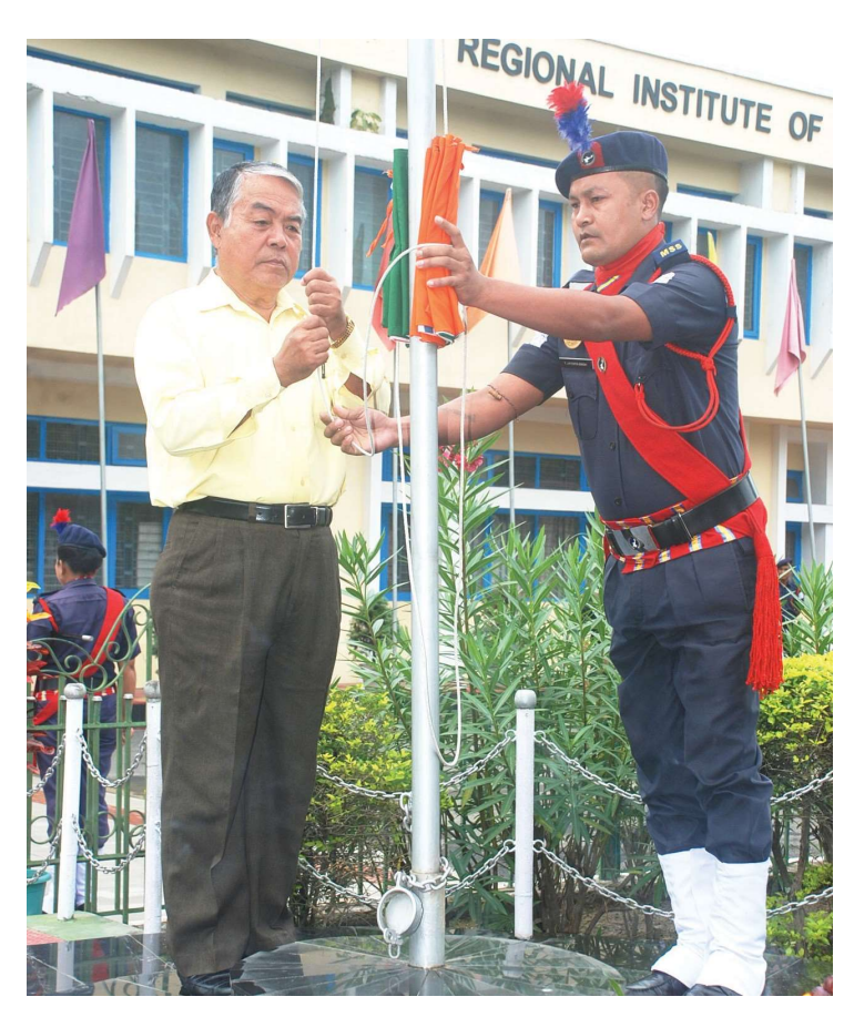
Independence Day Celebration 2017