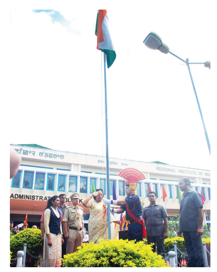
45th Foundation Day Celebration, RIMS, 2016