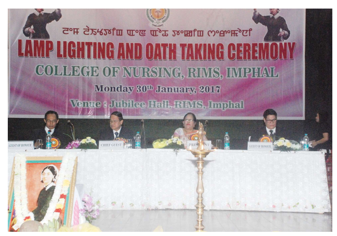
Lamp Lighting and Oath taking Ceremony2017