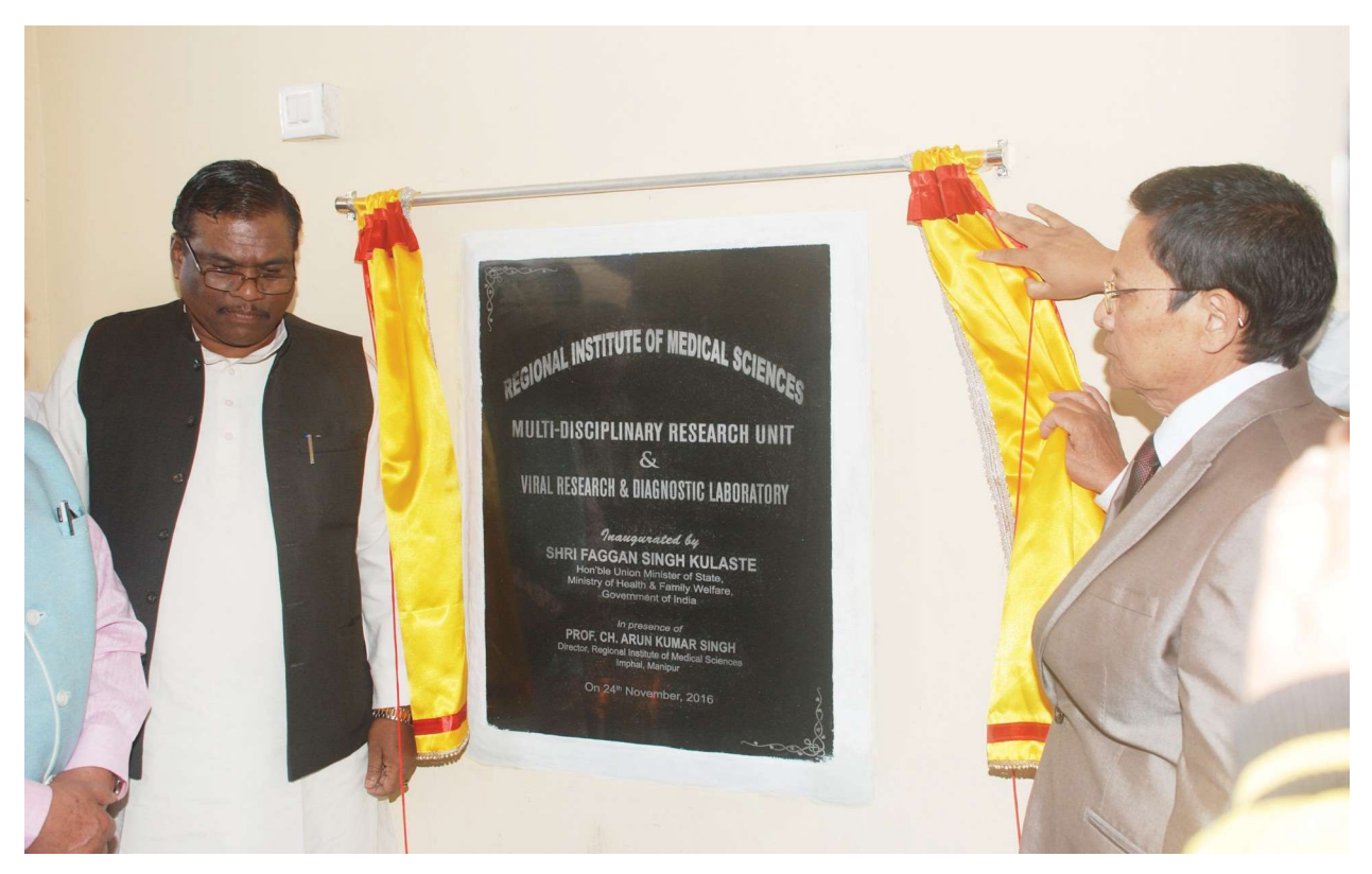
Inauguration of Multi-Disciplinary Research Unit by Honourable Union Minister Of State for Health and Family welfare , Shri Faggan Singh Kulaste