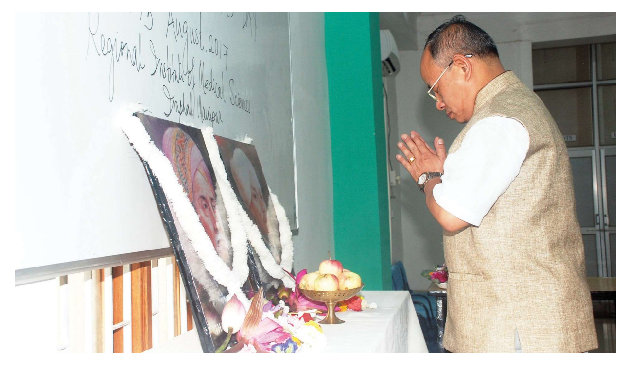
Patriots Day Celebration 2017