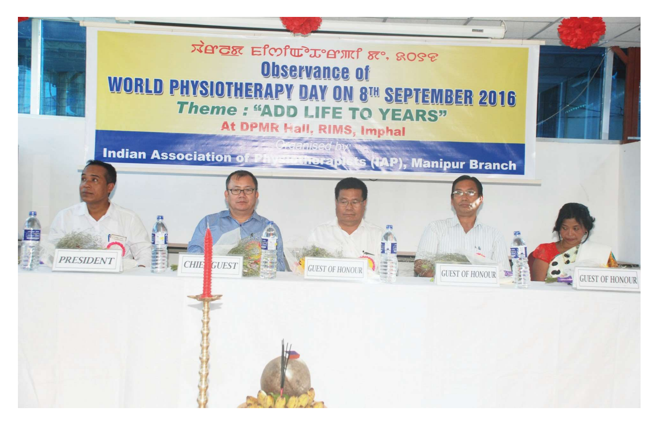
Observance of World Phsiotherapy Day, 2016