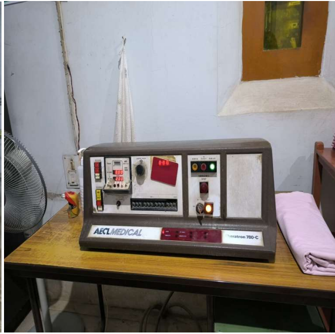
Cobalt Teletherapy 780C Unit and Treatment Console